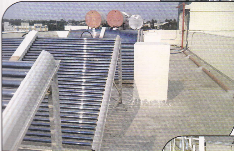
● Solar Water Heater System